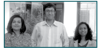
South Asian Bar Association of Northern California Pro Bono Committee